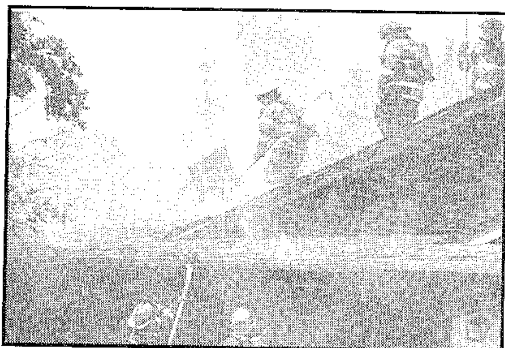
Funding to keep trained Firefighters

A. If a local funding measure is approved, the funds could only be used to provide fire protection and emergency services in the areas served by the District. The funds could not be used for any other purpose or in any other areas. Also, the revenues and expenditures for these funds would be regularly audited by an independent auditor and would be presented to the public annually at a noticed public hearing.